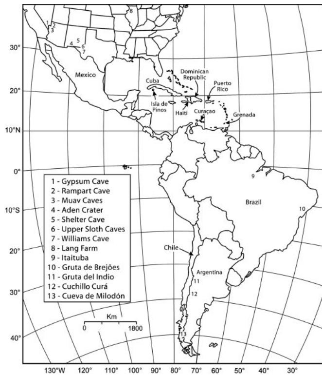
Fig. 1. The Americas, showing continental fossil sites mentioned in the text.

200 m above the Colorado River on the southern wall of the Grand Canyon in Mojave County, AZ (8, 21–23). The 14 C dates on surface sloth dung range from 10,400 ± 275 to 11,480 ± 200 radiocarbon years before present (yr BP). The oldest date is >40,000 yr BP at a depth of 130 cm.